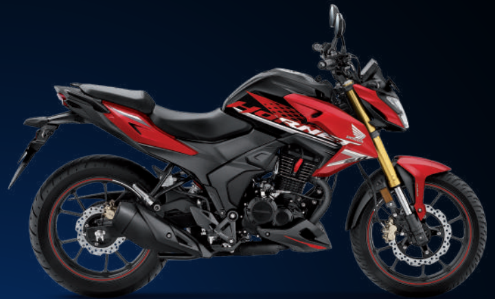
Radiant Red Metallic